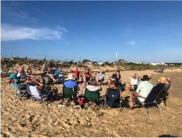
Our welcome back picnic on Mayo Beach this past week